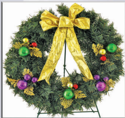
C - 20" Ornament Wreath