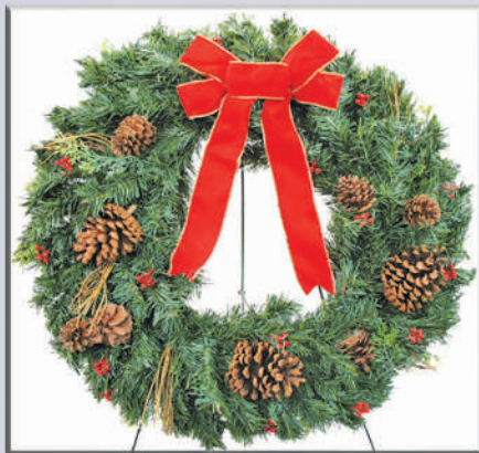
A - 20" Pinecone Wreath