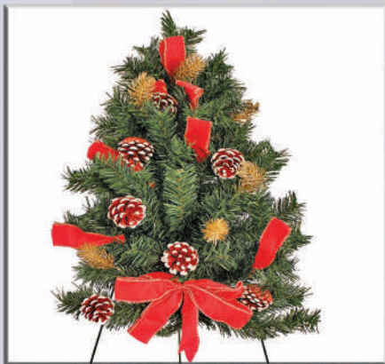
E - 24" Pinecone Tree