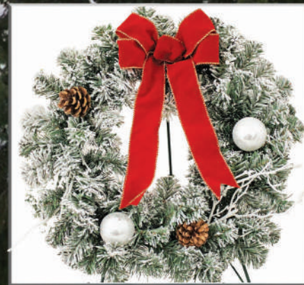
G - 20" Flocked Wreath

Fresh pine placement options are on the back.