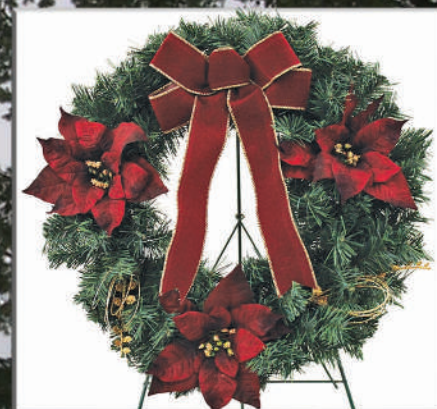
D - 20" Poinsettia Wreath