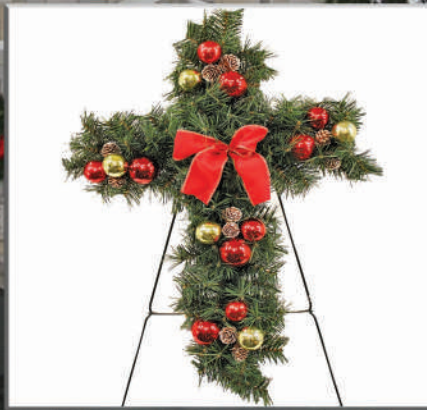
F - 24" Cross