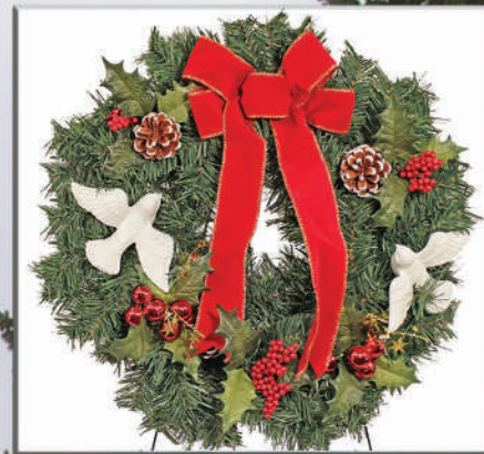
B - 20" Dove Wreath